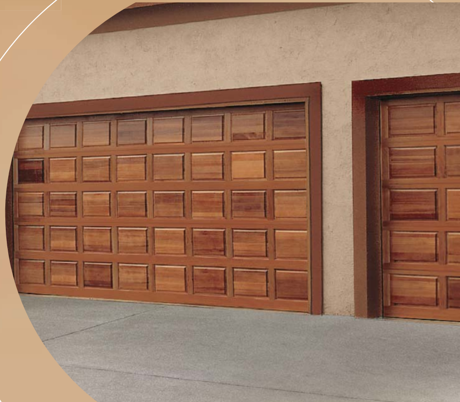
Model R38RE shown with Spot for Lag Option